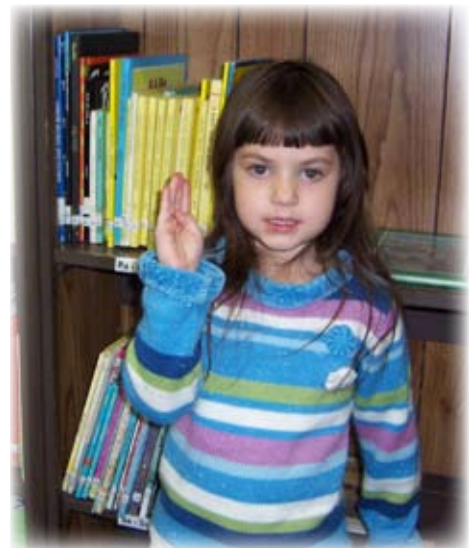
What color is the sky? Blue